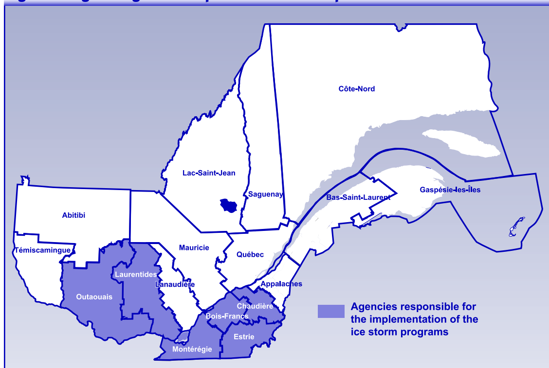
Figure 1: Regional agencies for private forest development

The program interpretation committee, made up of MRN and MAPAQ representatives under the direction of the MRN, is responsible for interpreting