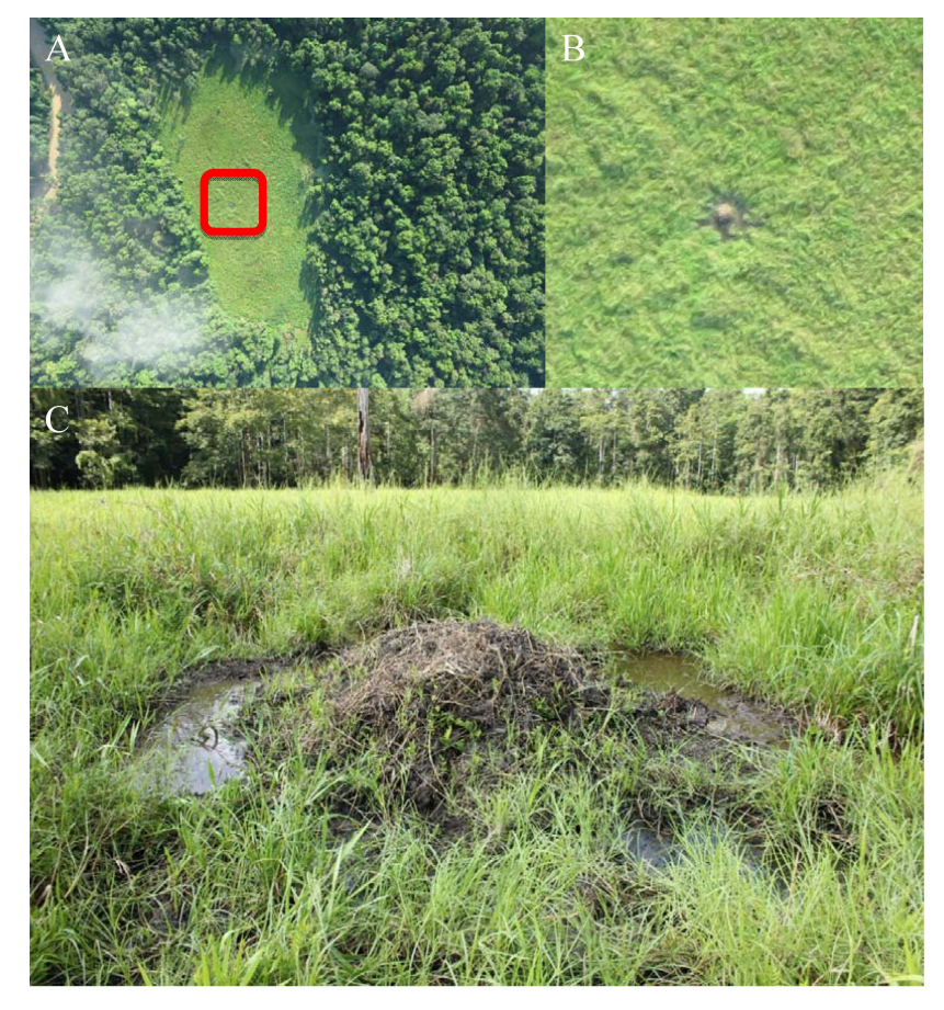
FIGURE 4. A) The raw aerial image of a potential nest (red outline) located in Koyah tributary, one of the largest tributaries of the Kinabatangan River. B) Zoomed image displaying potential nest. C) Confirmed nest found in Koyah tributary. The central mound is surrounded by marshy wallows used by a female. The mound measured 60 cm in height and 1.5 m in diameter.