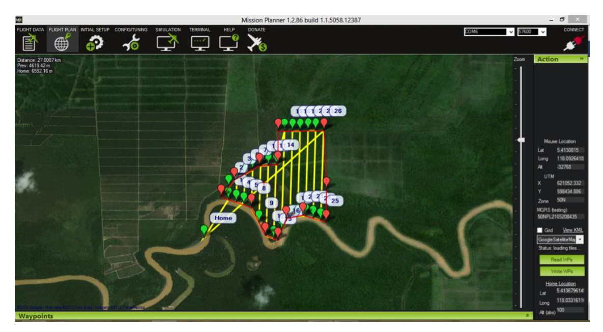
FIGURE 1. Planning missions using Auto Pilot Module (APM) planning software. Flights were flown in a grid formation with transects separated by a predetermined distance to allow sufficient overlap for stitching. Transect separation was 170 m. The image displays the actual route taken by the unmanned aerial vehicle (UAV) during a single flight covering around 300 ha.

Evans et al.—-Use of drones for behavioral research.