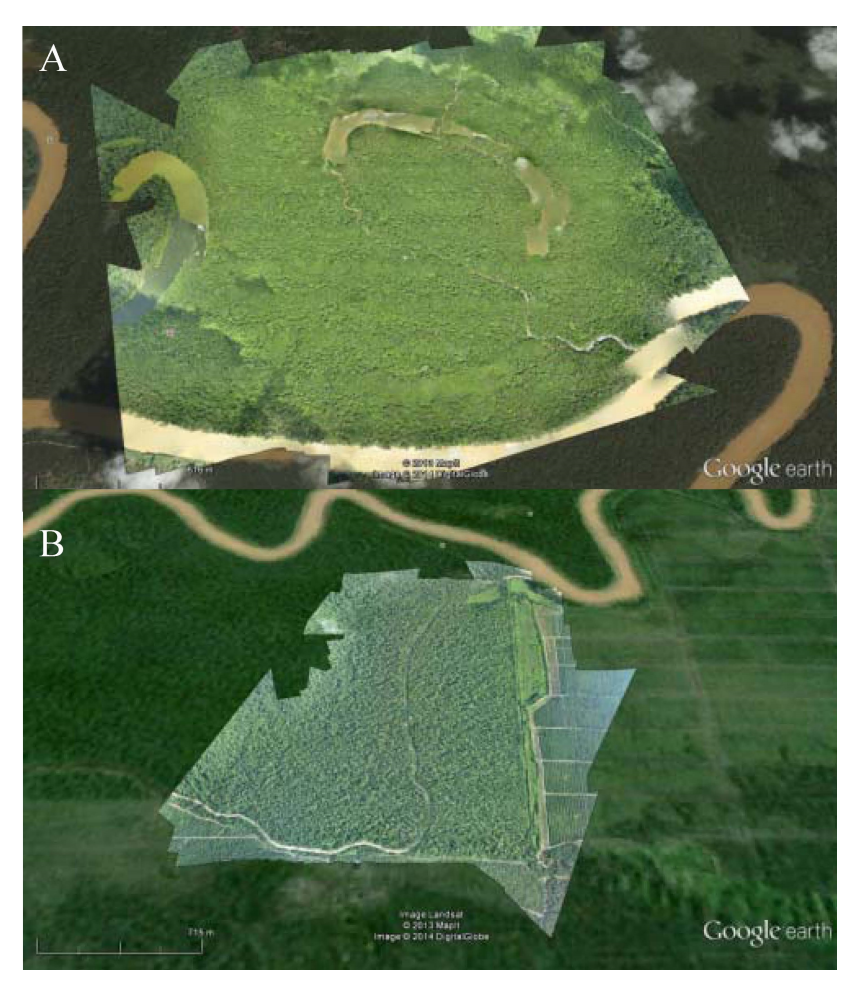
FIGURE 3. A) Stitched image of 280 ha fight flown at 0700 local time GMT+8, where the stitching quality was of high. B) Stitched image of 390 ha flight flown at 1400 local time GMT +8, where the stitching quality was of low.

Evans et al.—-Use of drones for behavioral research.