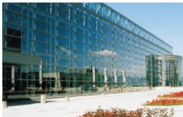
CENTRE DES CONGRES DE QUÉBEC

Québec City's Convention Centre is located in the heart of the tourist district. Underground walkways link it to the city's main hotel complexes. Built only recently, the Convention Centre boasts the latest equipment and technology. It is here, in this ultra-modern building, that the communications nerve centre for the 12 th World Forestry Congress will be installed, deploying various means of communication to publicize Congress activities throughout the world.