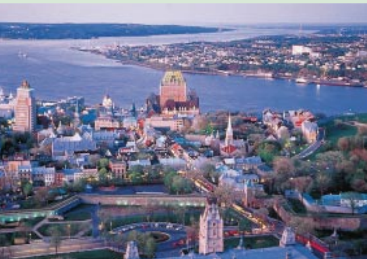
COMMUNAUTÉ URBAINE DE QUÉBEC

Located just one hour's drive from the American border and two and a half hours from Montreal, the Québec City region is home to 170 research centres, 127 of which are linked directly or indirectly to Laval University, the oldest French-speaking university in North America, founded in 1663.