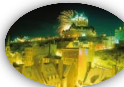
Even at night, the Old City maintains a magical quality.

Québec's national capital is not only a cultural and tourist centre, it is also the site of many different leisure activities.