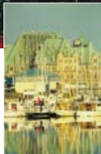
The Latin Quarter, one of the most picturesque areas of Québec City. In the background is the famous Château Frontenac. It was here that the FAO was founded in 1945.

Québec's national capital is not only a cultural and tourist centre, it is also the site of many different leisure activities.