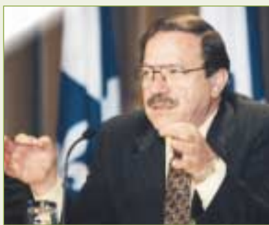
Jacques Brassard, Minister of Natural Resources, explains the bill tabled in Québec's National Assembly, which will lead to a renewal of the forest system.

The committee was created as part of an extensive general consultation process to give all stakeholders in Québec's forests, including representatives of the general public, an opportunity to modify the current forest system before the government introduces improvements in early 2001, in the form of amendments to its legislation and regulations.